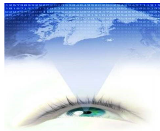
“Blessed are the eyes which see ...” (Luke 10:23)

well seen’ because he saw exactly as God saw. It was as a result of Jeremiah’s correct vision that God promised to hasten His Word to perform it. This is the key thing about walking by faith - the ability to