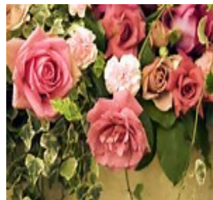
Spring Rose - symbolizing New Season

cies are new EVERY MORNING, they certainly are new EVERY YEAR too! Furthermore, just as fresh Manna came from heaven every morning to feed the children of Israel during the