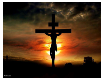
“...Cursed is every one that hangeth on a tree.” (Galatians 3:13)

Jesus, in dying on the Cross, was made a CURSE for us. In other words, just as the SCAPEGOAT in Leviticus (see Leviticus 16:21-22) Jesus took THE CURSE OF THE LAW upon Himself in order to free us from it!